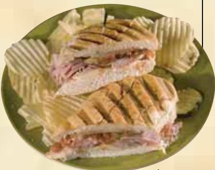
The Windy City

Rich melted Mozzarella cheese, ham, pepperoni, fresh portabella mushrooms, green peppers, onions and black olives, marinara sauce on a panini grilled hoagie roll. 6.65