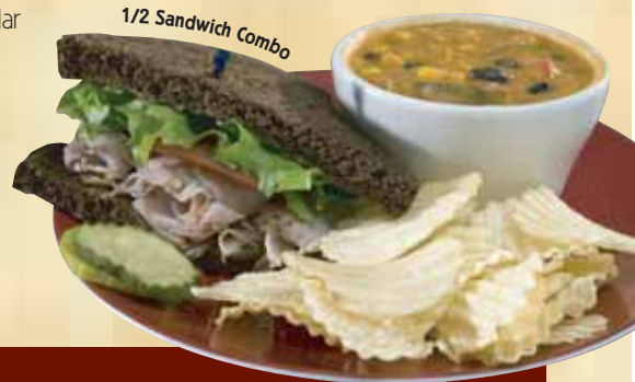
1/2 Sandwich Combo