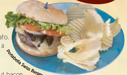
Portabella Swiss Burger

Fresh pattied burger*, melted Swiss cheese and portabella mushrooms, with lettuce, tomato, red onion, mayo & mustard on a grilled Kaiser roll. 6.00